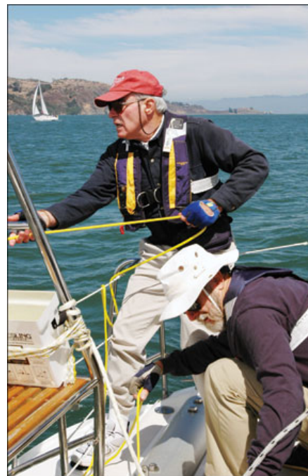
Once the victim is securely connected to the Lifesling, crew can haul him to the boat, hand over hand or using winches.

The Lifesling-assisted rescue allows for less-precise boathandling. It can be used in tack-only type maneuvers (Figure 8, Fast Return, Deep Beam Reach) or in those that incorporate a jibe (Quick Stop), with one important proviso: Although the Lifesling2 instructions say "circle the victim until contact is made," this is misleading. As any waterskier knows, a circular pattern is not an effective way to get the line into the hands of the skier. To bring the rescue line attached to the Lifesling into the hands of the victim, a button-hook approach is much preferred. During testing, the optimum Lifesling delivery always included passing closely by the victim prior to a sharp turn on the final approach. A wide turn that leaves the victim in the center of circle—as many published illustrations suggest—sharply reduces the chance of success.