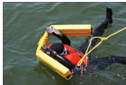
Getting into the Lifesling while wearing a PFD is not so easy. It is even harder with the inflatable Lifesling.

One of the key issues stressed by USNA's Rugg was that the practice conditions were optimum, in broad daylight, flat seas, and fair weather. He also noted that because the participants knew the exercise was a drill, they didn't experience the usual shock and stress. He emphasized that only through periodic training with a regular crew can you be fully prepared for an actual event.